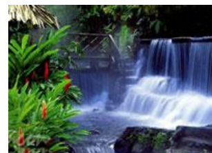
Tabacon Hot Springs

Options: Add dinner for an additional $20 per person. Upgrade to Eco Termales Hot Springs for an additional $50 per person including dinner, or Tabacon Hot Springs for an additional $74 per person including dinner.